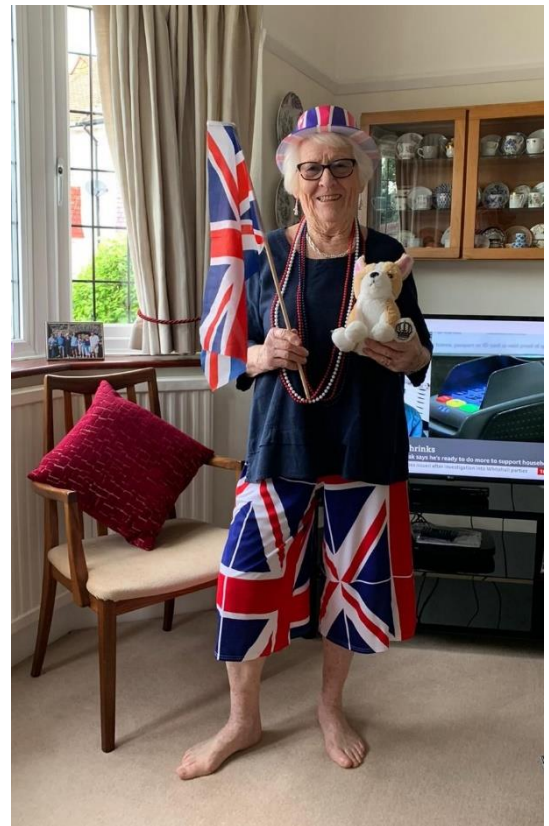
Stella is jubilee-ready!