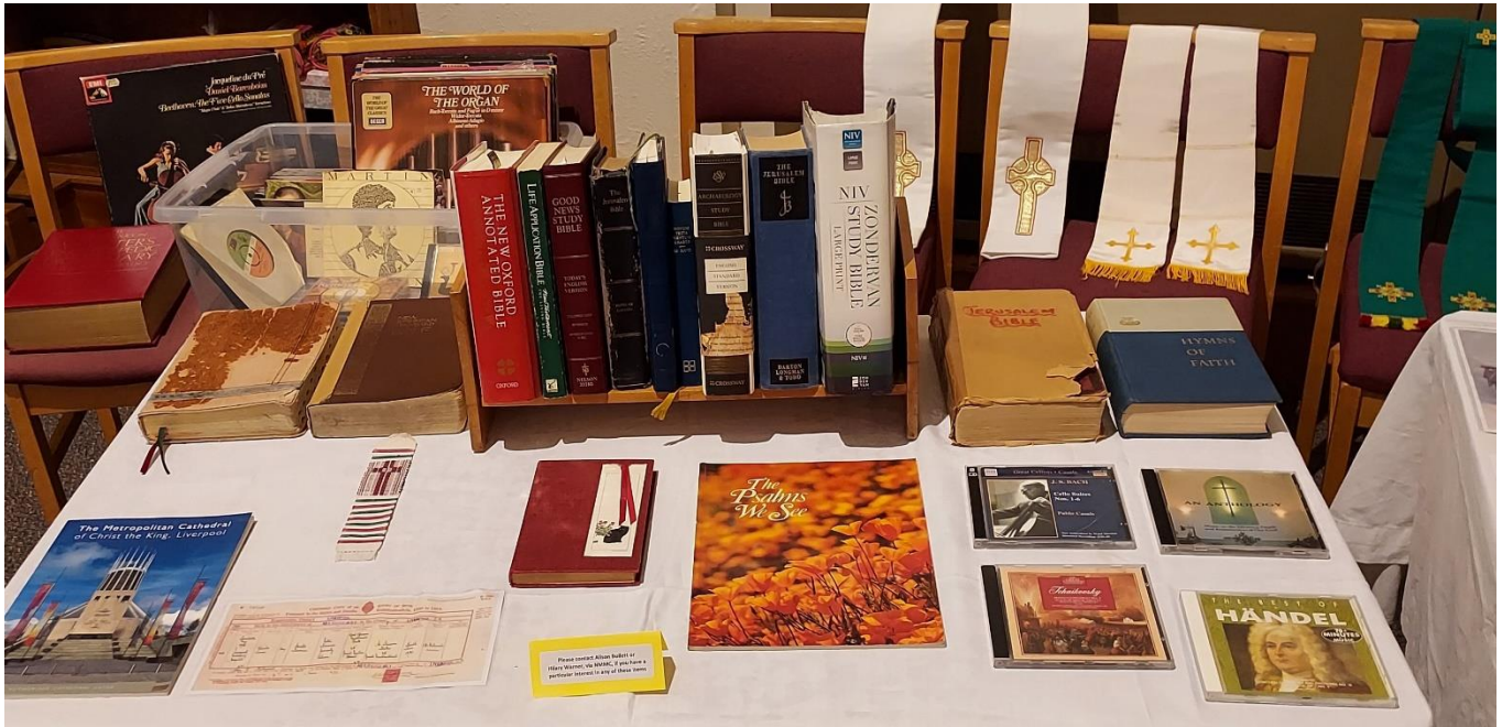
A selection of bibles, hymn books and music with various stoles.