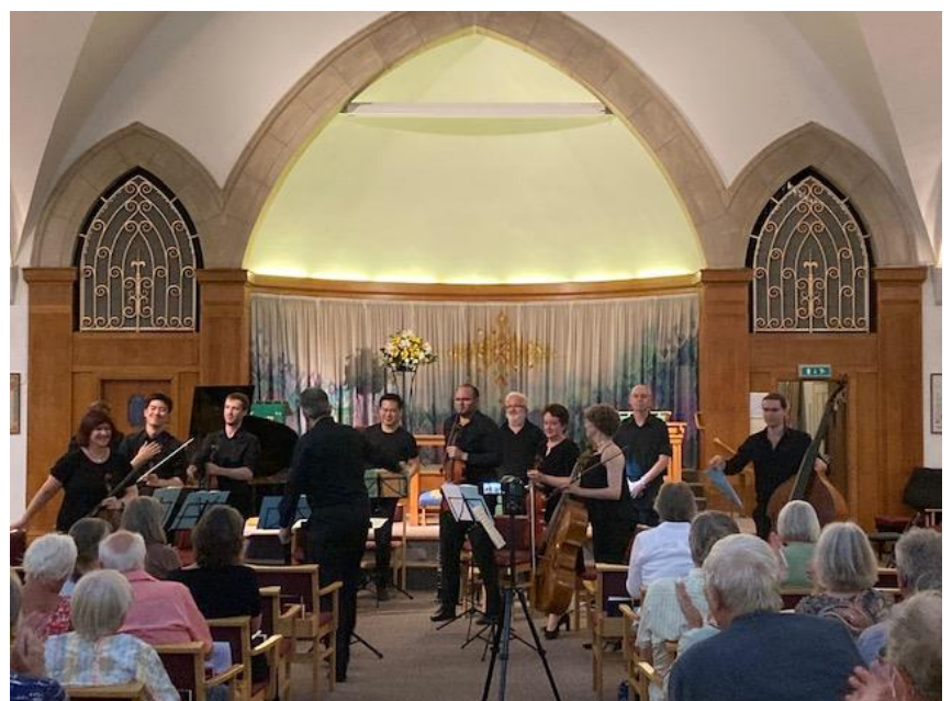
Riverside Sinfonia & the London Mozart players