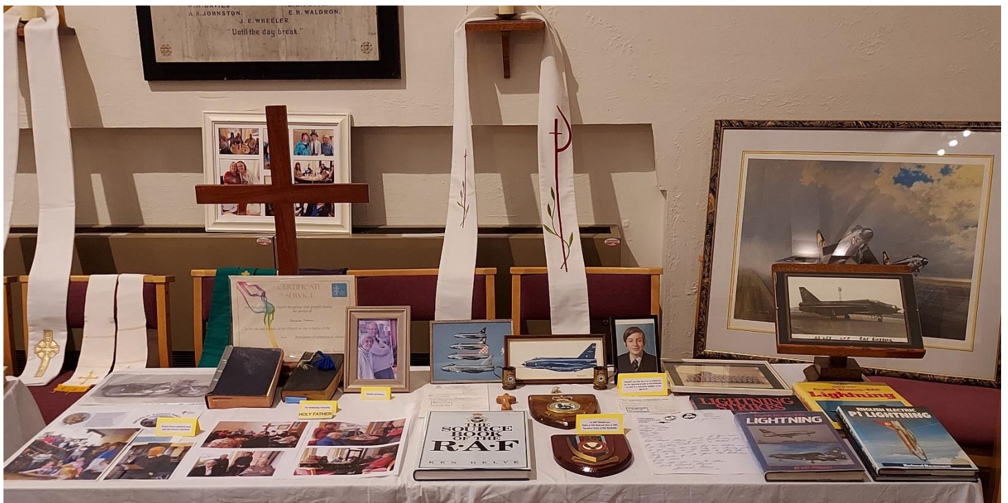
Photos from the Wednesday Fellowship and the Bookham church where he preached each month plus mementoes from his time as a padre in the RAF and his son's career as a Lightning Engineer.