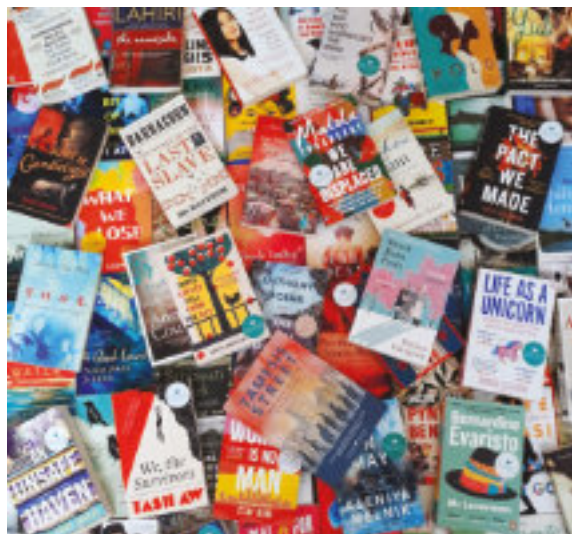
A selection of past books

but this one piqued my interest. ShelterBox is an international relief charity. Some of you may have come across them as they are actively supported by Inner Wheel amongst other organisations. They provide emergency shelter after disasters supplying essential items to families such as tents,