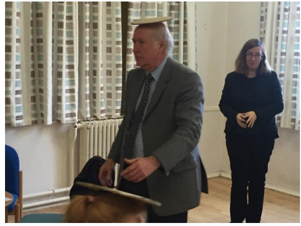
Can anyone think of a caption for this photo? A selection printed next time ©