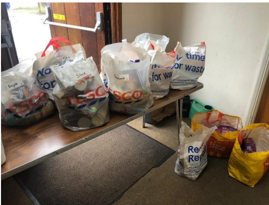
Bags ready for collection