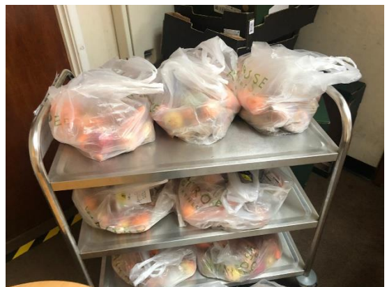
Fruit and veg bags