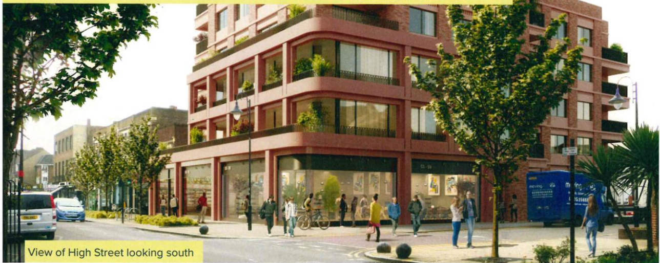
View of High Street looking south

Towards the end of last year, we shared our initial vision for the redevelopment of the former Tudor Williams building with the community in New Malden. We have taken the time to review your feedback and would now like you to join us for our next stage of consultation and an update.