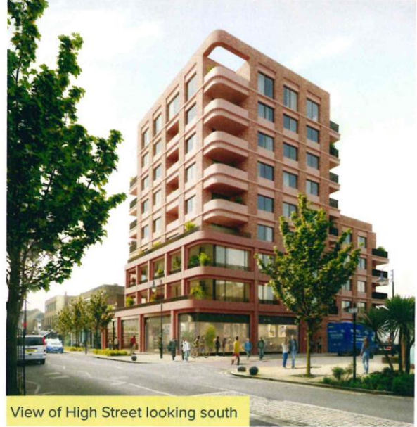
View of High Street looking south