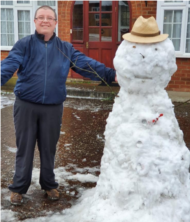
Karl built Cedric

Great excitement was caused by the snow a couple of weeks ago. Some people were even tempted to go out in it!!