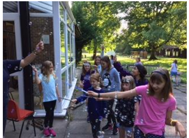
Using our wands to break 'spells'

After grass sledging we made pine cone owls. And finally we had to pack our bags and get everything. We got our cakes and owls and unicorns and Harry Potter bags. Finally we collected our badges that we got! We went to get our bags and got a chocolate frog! Then we said goodbye.