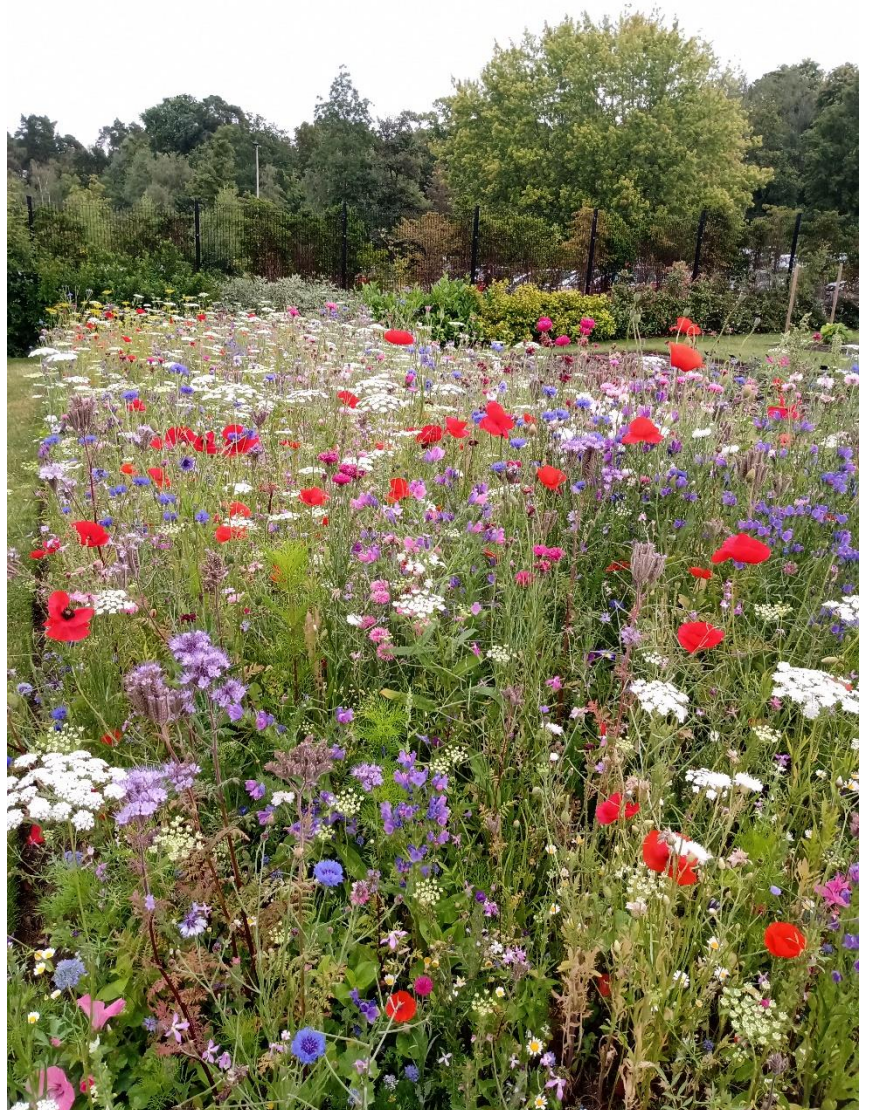
And a beautiful wild flower meadow at Wisley.