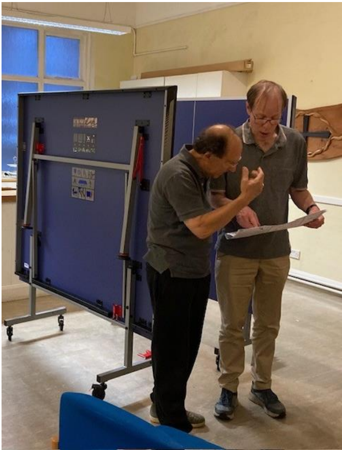
Even more head scratching (the instructions were essentially hieroglyphics)