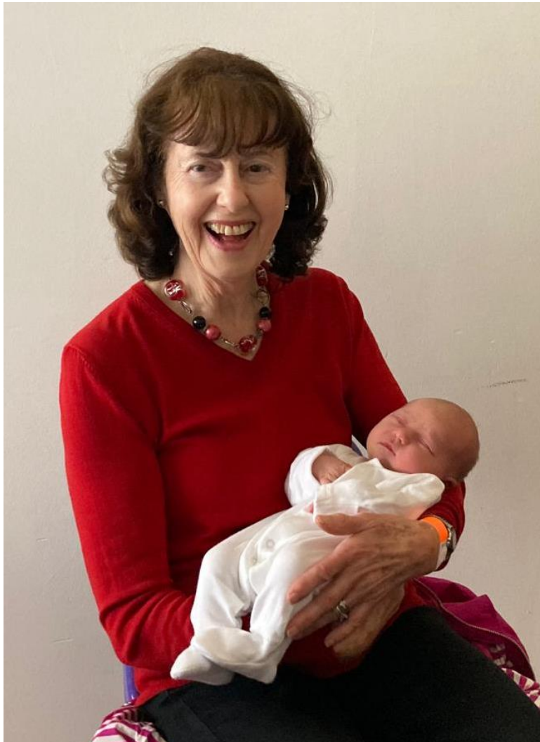
Very proud grandparents