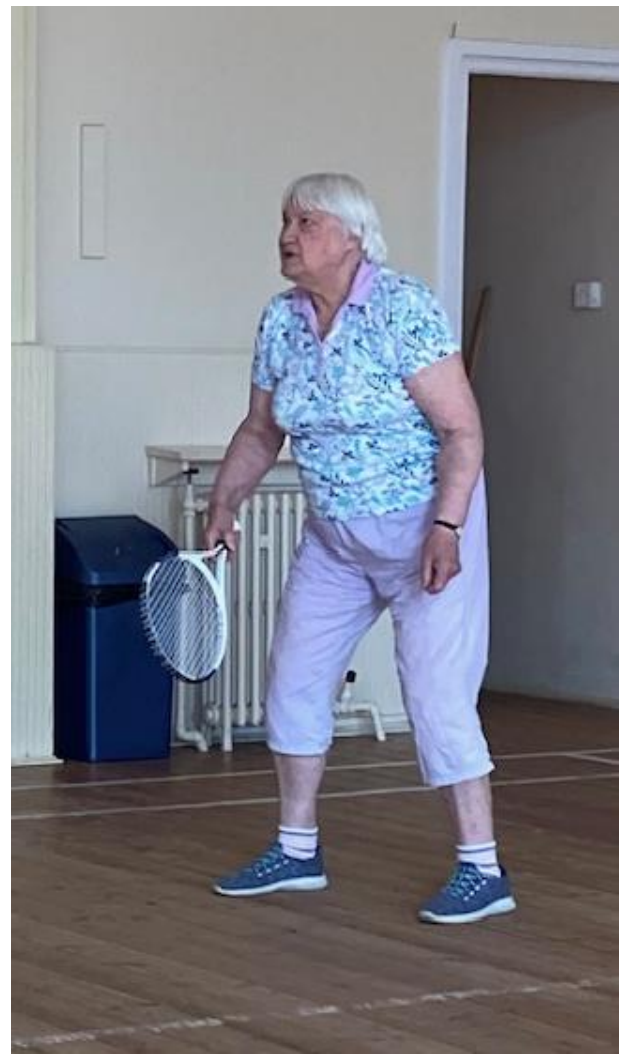
A good sportswoman always keeps their eye on the ball