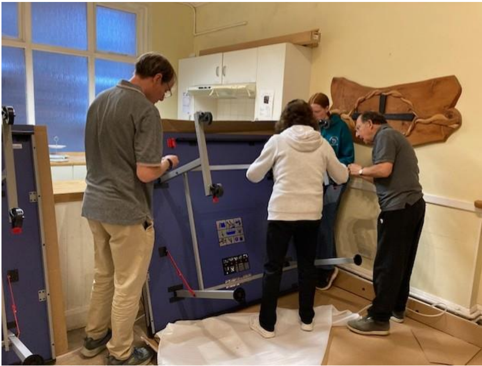
There was much head scratching: