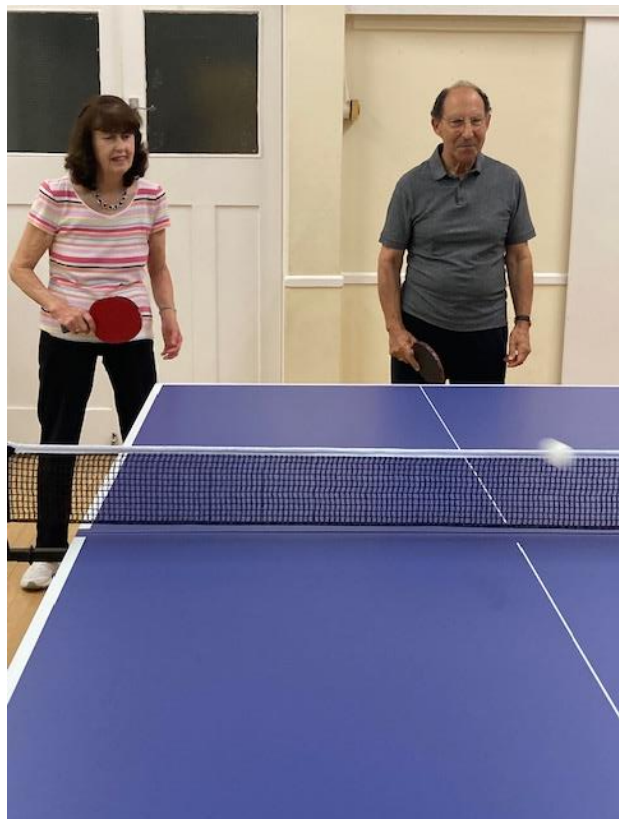
Spot the ball - there are prizes (not)

All good tv series end with a cliffhanger and a “see next week's exciting episode of xxxx” so here's the table tennis table in action. The suspense is over! In contrast to whole swathes of the country, it is blue and also a very perfect playing surface. This is to be applauded but does mean we can no longer blame the table for our wayward shots.