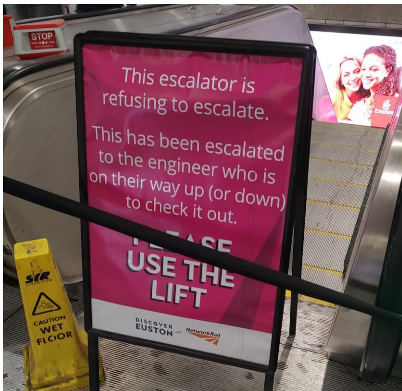
Spotted at Euston Station