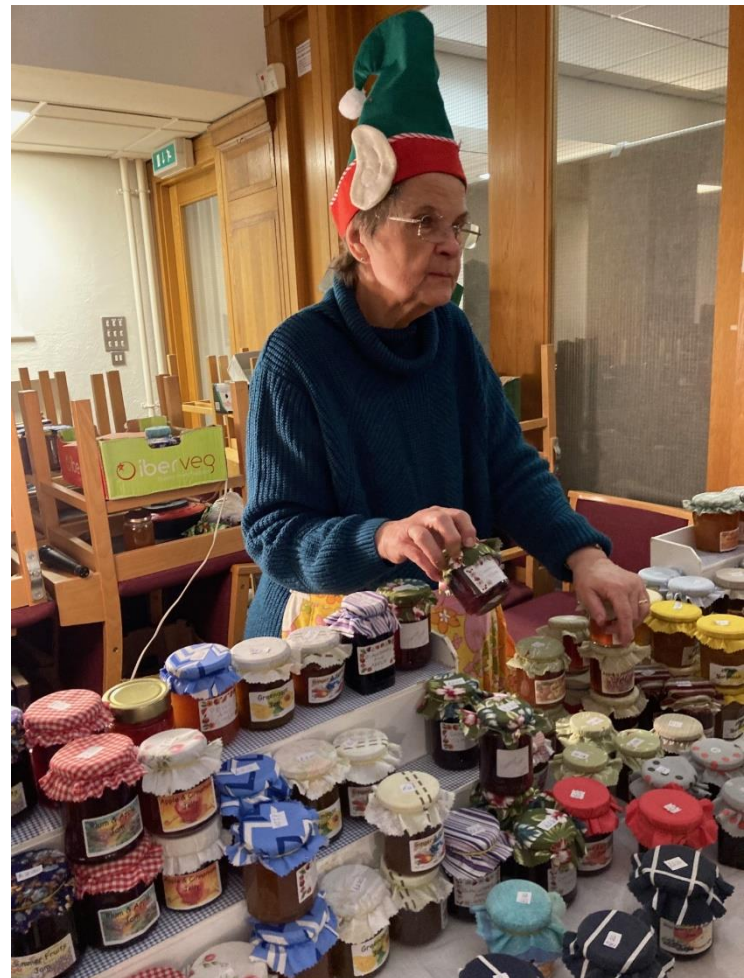
Ho ho ho!!