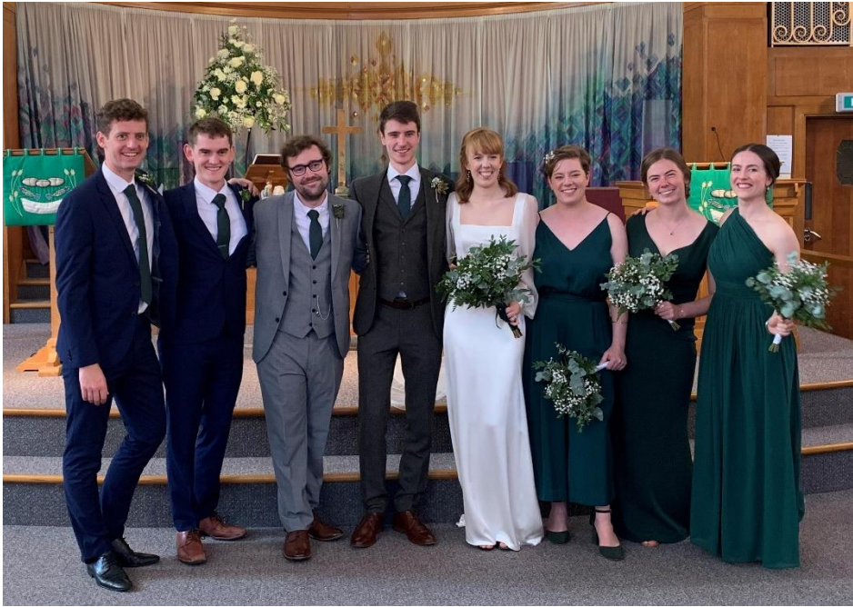
Groomsmen and Bridesmaids