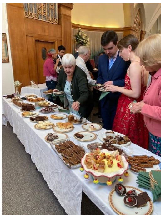
The magnificent spread