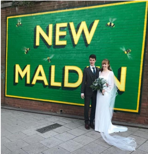
A stop on the walk down to the reception at the Royal Oak.