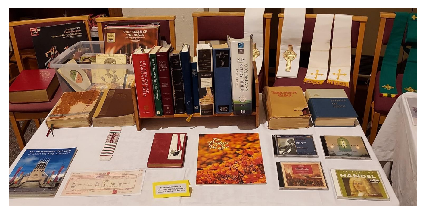
A selection of bibles, hymn books and music with various stoles.